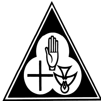
God the Father, Jesus the Son and the Holy Spirit

9/6, 9/13, 9/20, 9/27, 10/4, 10/11, 10/18, 10/25, 11/8, 11/15, 11/29, 12/6, 12/20